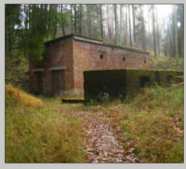
Brick ruin in the Eckerwald forest

More than 500 lives were brutally wiped out in the futile attempt to extract oil form shale.